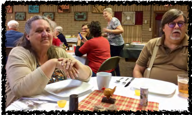
This couple joined us for the Thanksgiving meal enroute to visiting family for Christmas.