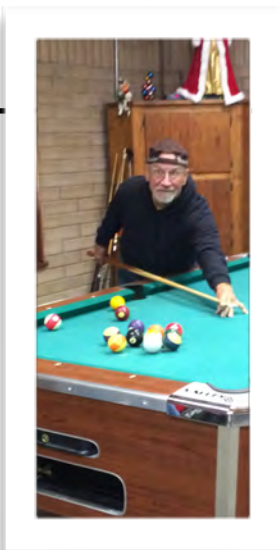
The SKP Park has a new pool table, funded by donations given to our newly formed POOL/ Recreation Committee.

We also welcome your ideas and suggestions to keep us moving forward.